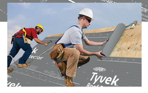
Easy to Install Lays down flat and easy to reposition.