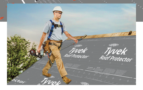
Lightweight, Strong Roof Protection Excellent grip to the deck and strength of product helps to minimize tearing at fastener points.