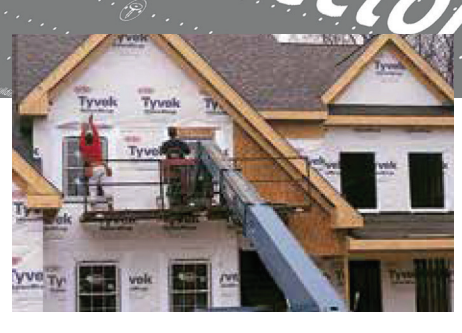
Trusted Quality and Durability A product you can rely on from DuPont, a leader in science-based building envelope materials.